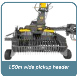
1.50m wide pickup header

With JF you take complete control over the time and manner your forage is harvested!