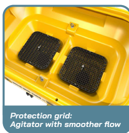
Protection grid: Agitator with smoother flow