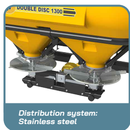
Distribution system: Stainless steel