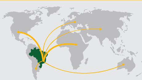
FROM BRAZIL TO ALL CONTINENTS OVER 50 COUNTRIES