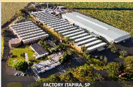
FACTORY ITAPIRA, SP