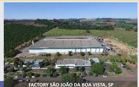
FACTORY SÃO JOÃO DA BOA VISTA, SP

Spreaders line JF, the solution for the farmer!