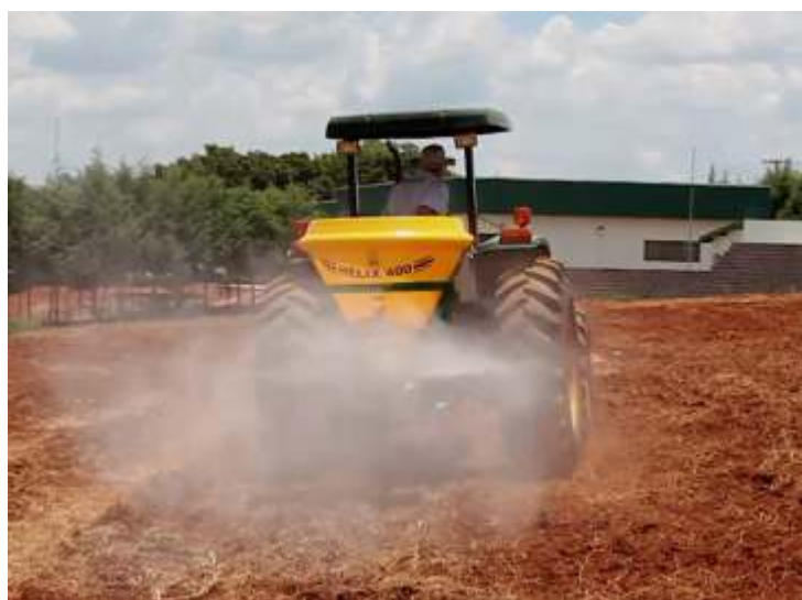
Spreader JF Helix 400