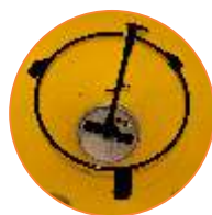
Special shaker for limestone