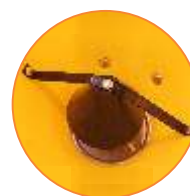
Shaker with cone

Technical description: Single disc fertilizer and seed spreading equipment, with capacity of 400 and 600 liters, powered by tractor PTO, frame made of steel, hopper buit in polyethylene, featuring rotor disc with four paddles with range from 9 to 16 meters, shaker with cone, special shaker for limestone, dosage control, doser disc adjustable by lever, driven by PTO shaft, required power at PTO of 30hp for 400L capacity and 50hp for 600L capacity.