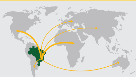
FROM BRAZIL TO ALL CONTINENTS OVER 50 COUNTRIES