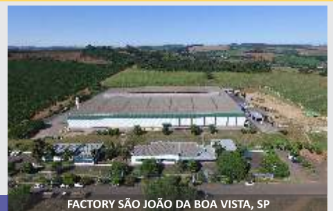
FACTORY SÃO JOÃO DA BOA VISTA, SP

Forage harvesters line JF, the solution for the farmer!