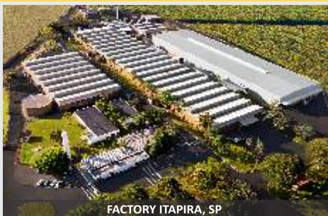
FACTORY ITAPIRA, SP

The best precision forage harvester ever!